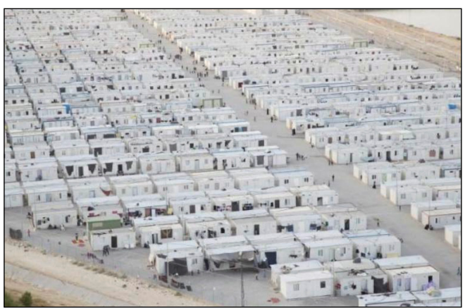
Fig. 2: Disaster shelters (Nadarajah, 2018)

Earthen construction can be utilized to build the affordable housing in low-income countries and disasters refuges using soil from the surrounding area. Natural disasters thing cannot be prevented by any technology leaving the victims homeless and exposed to the external actions. According to previous disasters refuges analyses, state that to build hundreds or thousands of refuges its take years ( Fig. 2 ). Utilization of 3D printing technology with the use of local materials for construction of the refuges, this can reduce the construction time to months and reduce the cost of materials and the cost of the project in half, since the refuges are temporary, its good alternative to save money throughout the construction process.