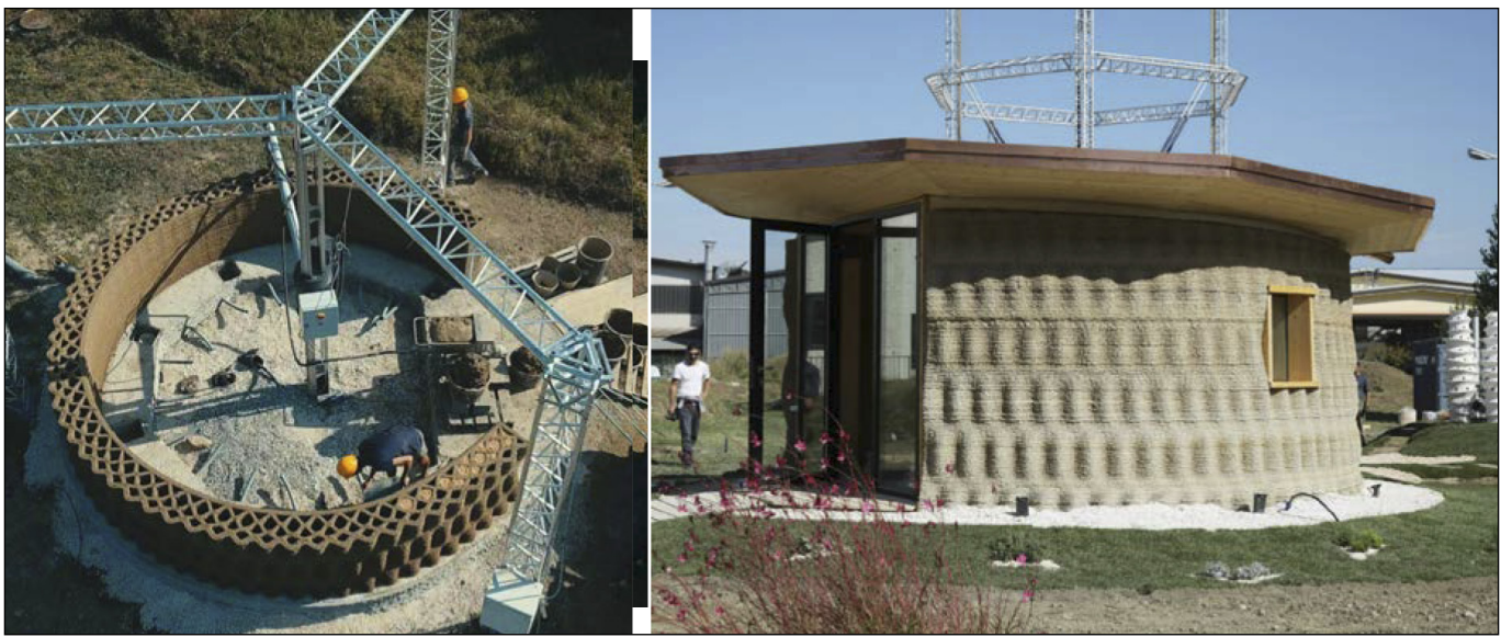
Fig. 3: Gaia house (Gaia, 2018)