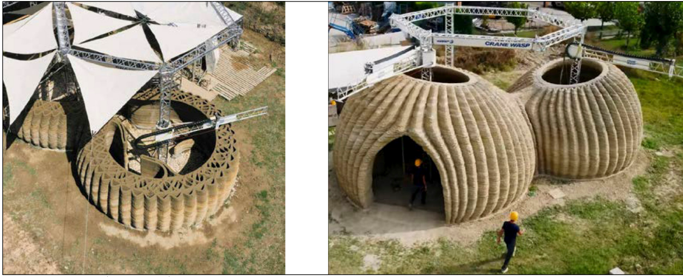
Fig. 4: Tecla house (Tecla, 2020)

Utilization of 3D printing technology with the use of local materials for construction of the refuges, this can reduce the construction time from years to months and reduce the cost of materials and the cost of the project in half, since the refuges are temporary, its good alternative to save money throughout the construction process.